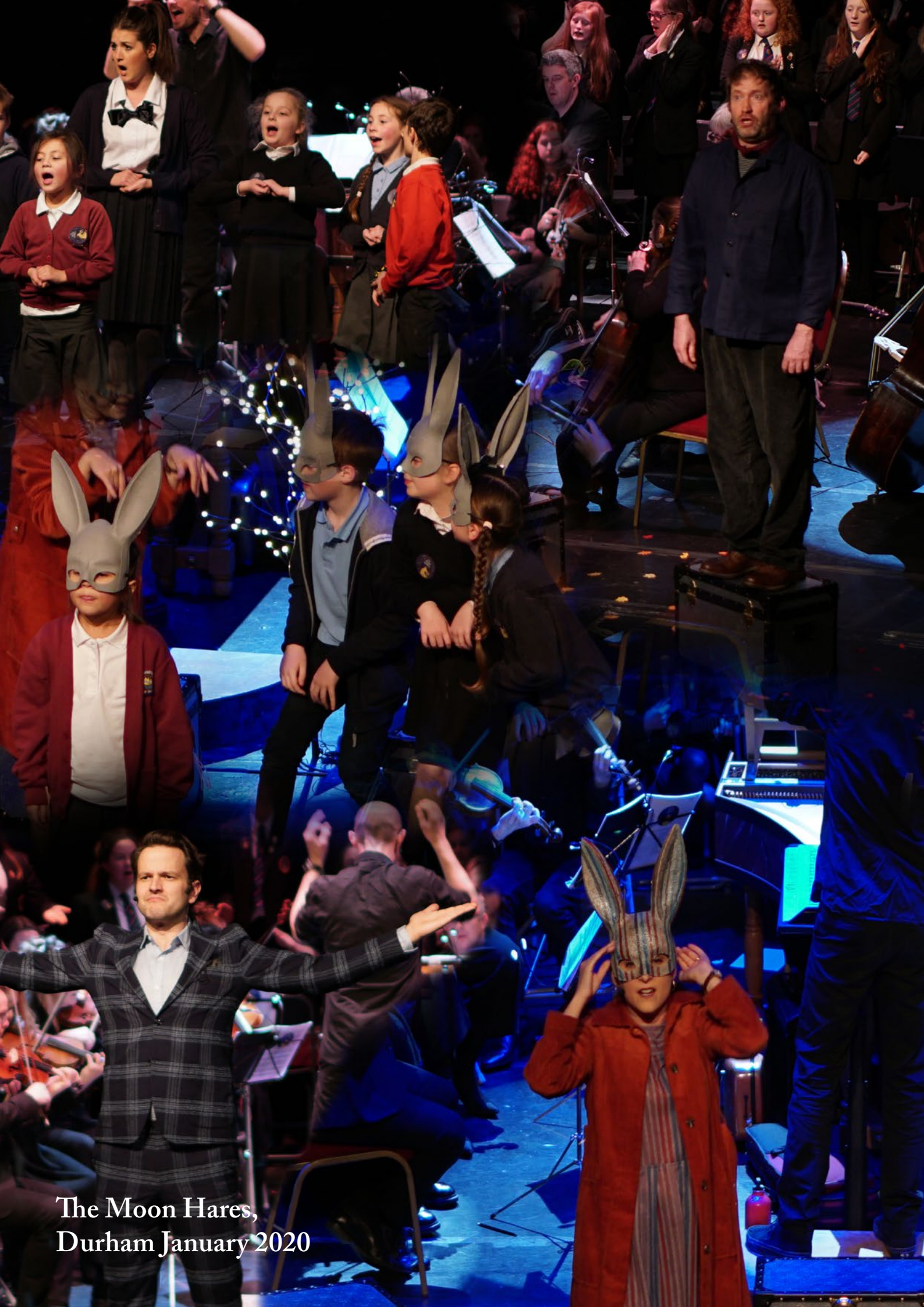
The Moon Hares, Durham January 2020