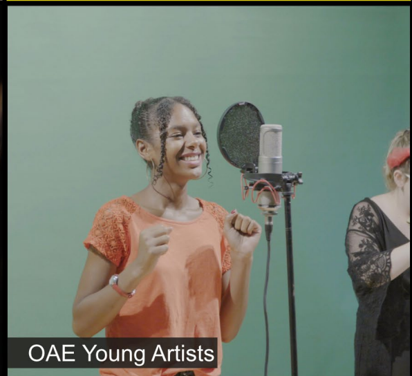
OAE Young Artists