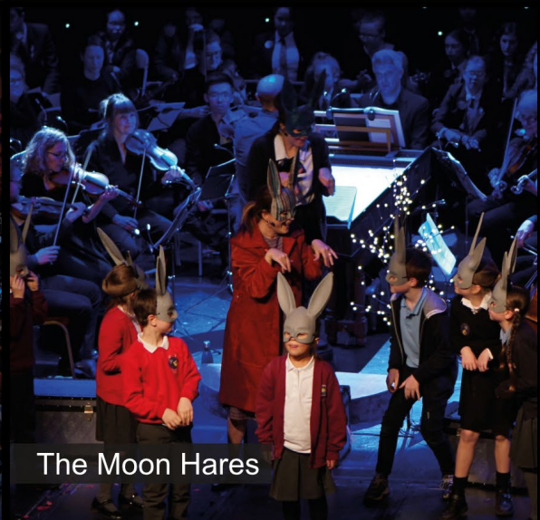
The Moon Hares