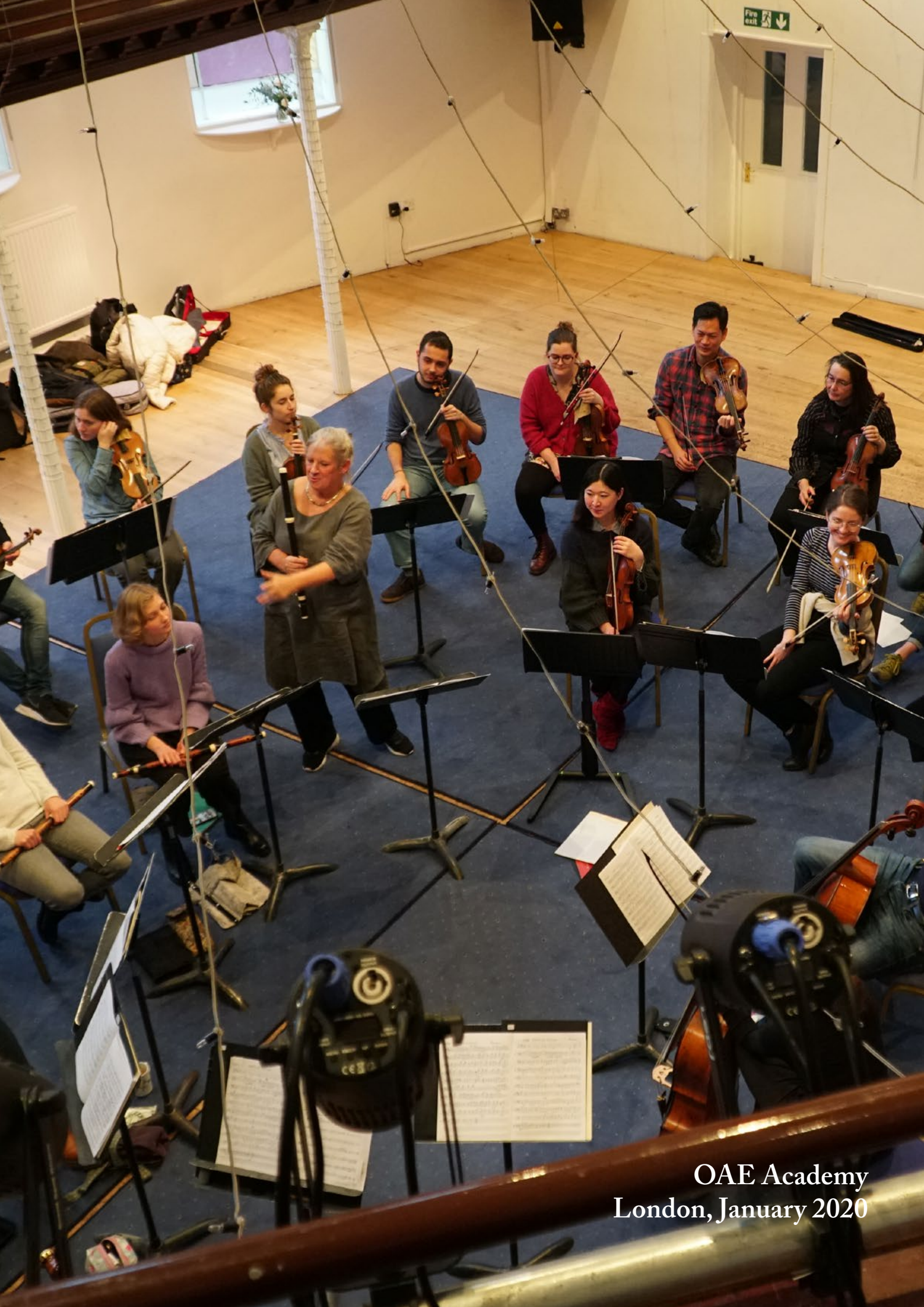
OAE Academy London, January 2020