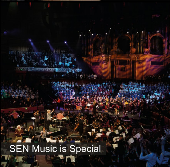
SEN Music is Special